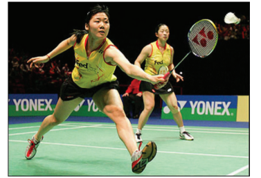
Badminton in Brief