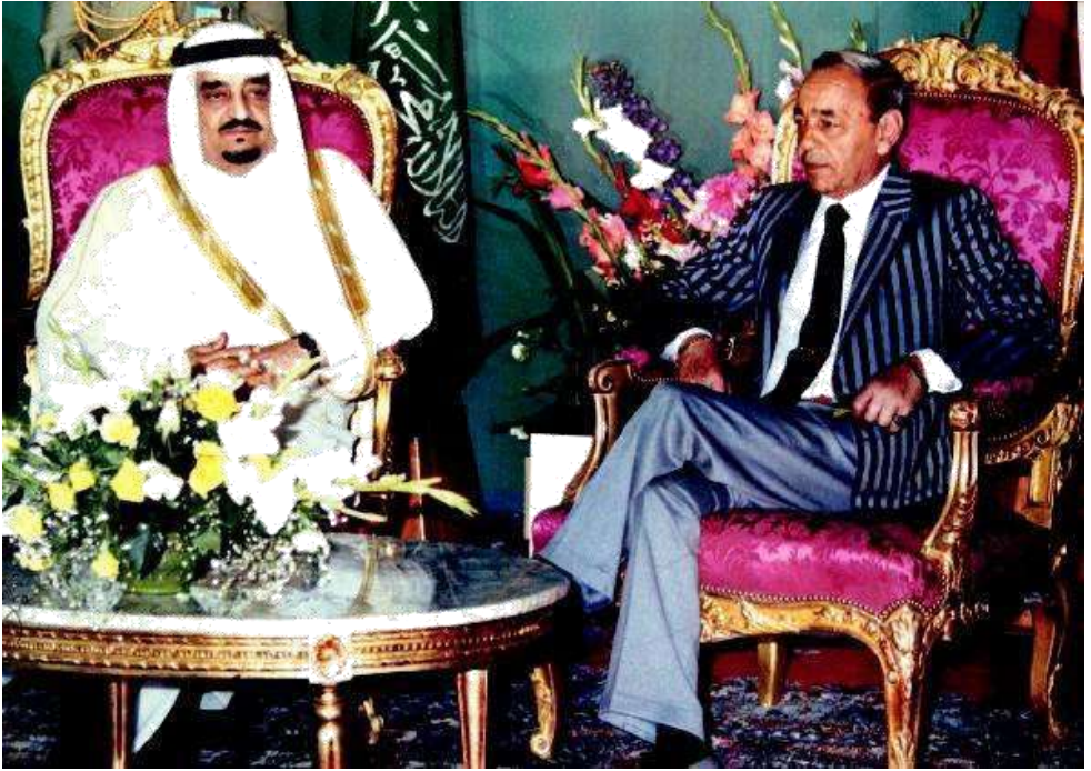
The late King Fahd Ibn Abdulaziz of Saudi Arabia and the late King Hassan II of Morocco, the University's two founding brothers (Al Akhawayn).